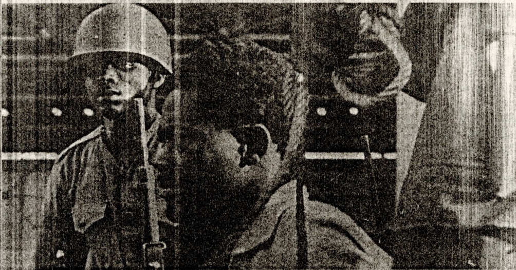
Patrice Lumumba, martyred leader of the revolutionary struggle in the Congo was a victim of capitalist inspired violence and terrorism in an attempt to stem the tide of the African Revolution. Lumumba is seated here in a jeep, hands bound, just prior to his assassination.

The imperialist clique saw the threat he presented not only to their control of the Congo, but Africa as a whole (if the Congo was allowed to succeed) and the rest of the communities of Asia and Latin America. He was a man of firm principles and beliefs and would not be one of their bootlickers or lackeys. The imperialist henchmen, the CIA were put into action. Before independence various threats, disruptions and attempted massacres occurred. Rumors were circulated that Lumumba was a Communist and that the Soviet Union would take over. Moise Tshombe, son of one of the few wealthy businessmen in the Congo, was more to the imperialists' choosing. He threatened Lumumba with the secession of the province of Katanga,